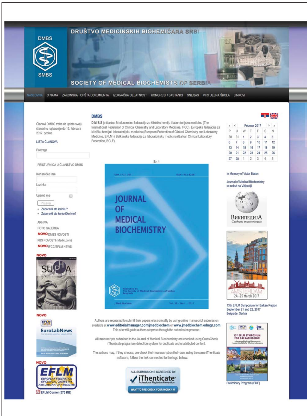
Figure 2 Cover page of the Society Medical Biochemits website (www.dmbj.org.rs)